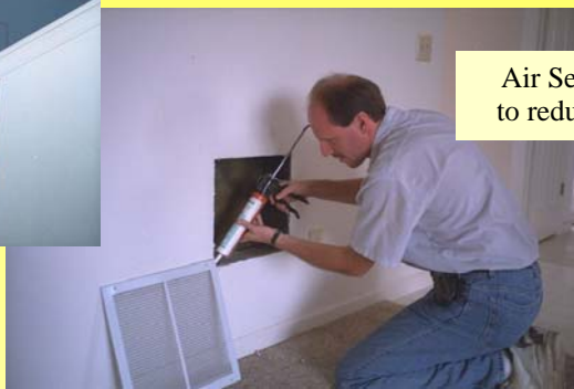
Air Sealing— to reduce drafts