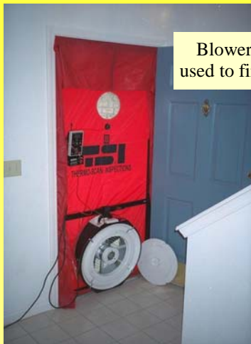
Blower Door— used to find air leaks

Enjoy Lower Utility Costs And Increased Comfort!